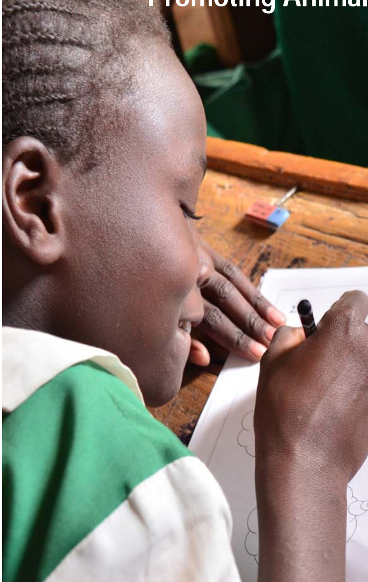
A learner filling in the animal welfare club manual

Number of students reached since inception: 11,165 Number of schools in the program:42 Number of teachers trained:44