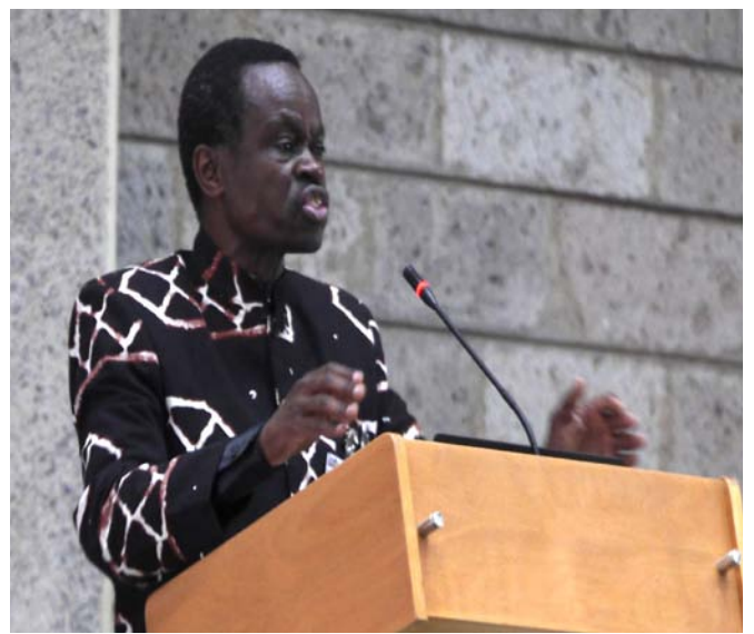
Prof. PLO Lumumba delivering the key note address during the The 2018 edition of the Africa Animal Welfare Conference (AAWC)